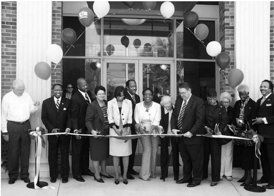
School officials and community members officially open The Dufrocq School on August 27, 2009.