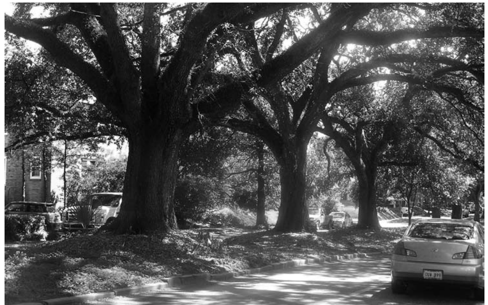
Adopted oaks on Park Blvd.; (L-R) The Eugene Franklin Fleming Oak, The Bayou Goula Oak, and The Istrouma Oak. All are registered with the Live Oak Society.

The adoption program's initial target area included the Kleinert, Park, and Cherokee medians, but organizers now seek to extend it to the Terrace Avenue Oaks as well.