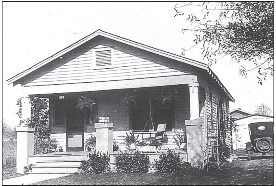
This is what 1951 Tulip Street looked like in 1922. Love the Car!

SUPPORT OUR MID-CITY MERCHANTS THIS HOLIDAY SEASON