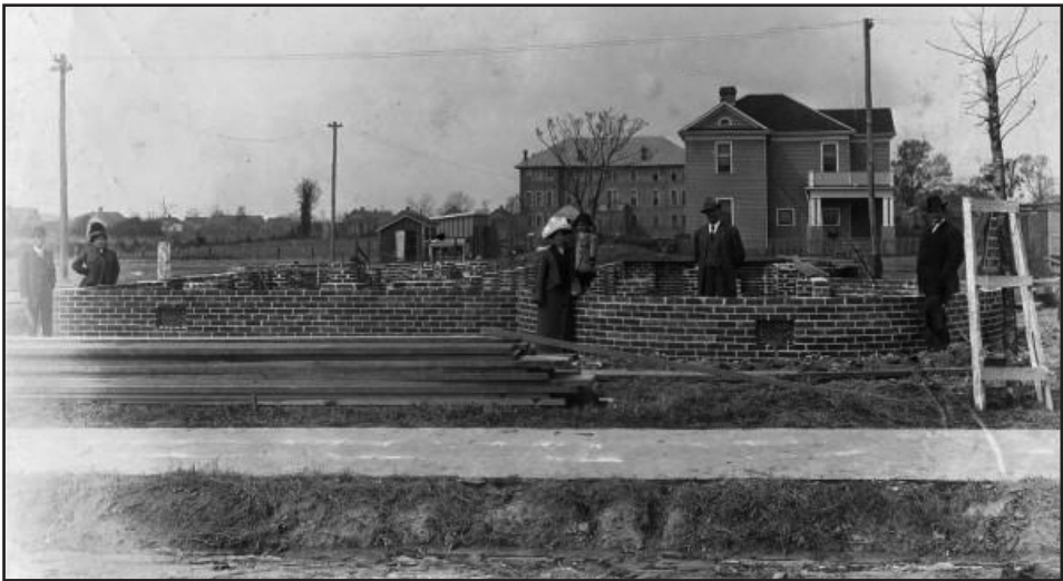
Foundation of Boehringer house on Goldenrod Ave., now Park Blvd., 1912.

You can submit your information on the Garden District website at http://gdcabr.org/hood_members_signup.php ; fill in