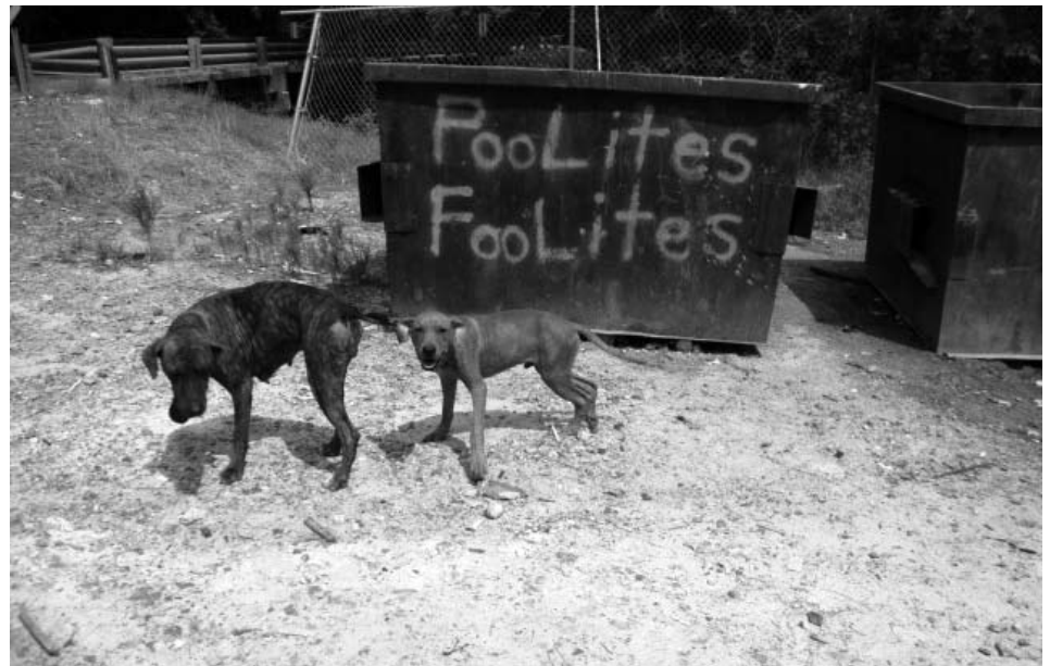
These emaciated dogs were rescued by Northside Humane Society from this rural dump site. They have since been treated and are now healthy and ready to adopt. The Baton Rouge Rescue Bank makes it possible for groups like NHS to continue helping abandoned dogs and cats like these.

homeless animals for as long as she can remember, often brought home new pets, much to the chagrin of her mother.