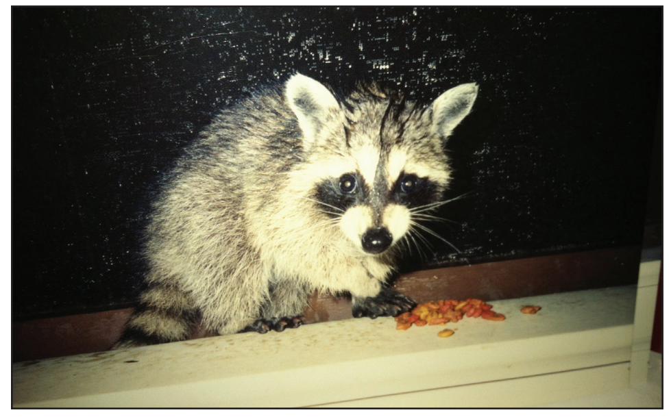
Other residents of the garden district!

Not up on the care and feeding of baby raccoons, the Wallaces called an LSU wildlife agent who told them to feed the small raccoon Tender Vittles cat food which the young raccoon soon learned to "wash" in the rain water in the gutters. The agent informed them that their guest should leave in a few weeks. "Actually, he kept me com-