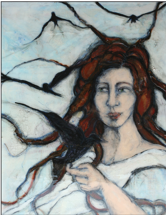
"Coming Home" by Therese Knowles depicts birds guiding a woman home.